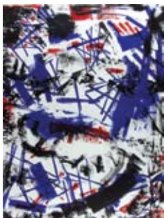
Florence Putterman 9/11 Revisited , 2006 Monotype 30" x 22"