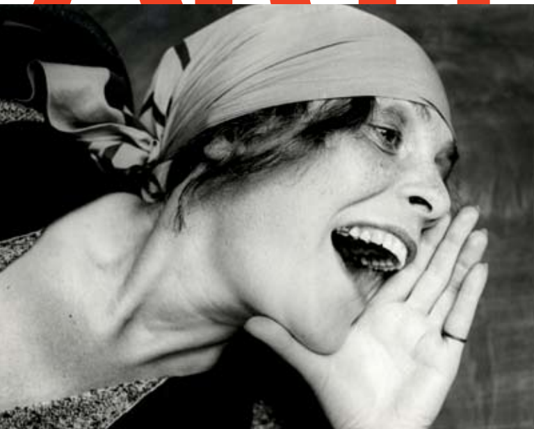
Aleksandr Rodchenko, Lily Brik , 1924, ART IN REVOLUTION