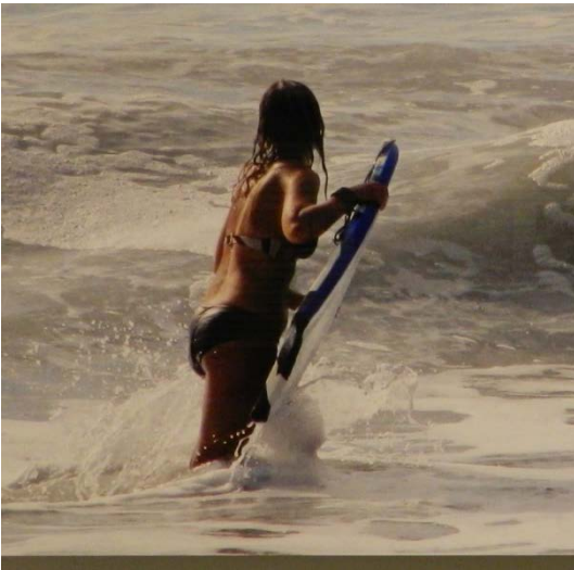
FIGURE AND FORM EXHIBITION @ The Loranger Gallery