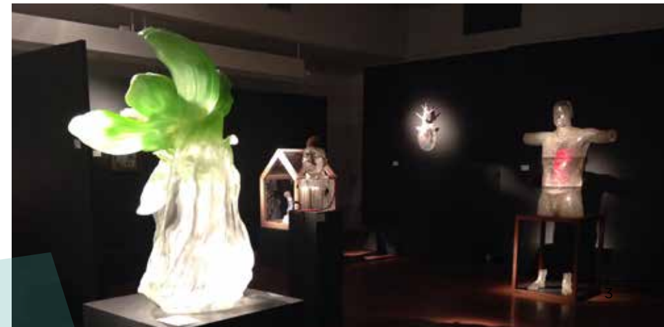
Below: Durante Gallery at the Longboat Key Center for the Arts 2016 Glass Exhibition